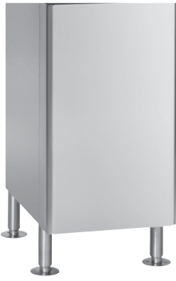
Standard base stand. 12BASE-00 shown.