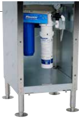
Optional filter system factory installed in base. 12BASE-CF shown.

Stainless steel base stand transforms Follett® countertop dispensers into freestanding dispensers. All bases include stainless steel exterior (accent trim on 25 and 50 Series) and stainless legs with adjustable flanged feet.