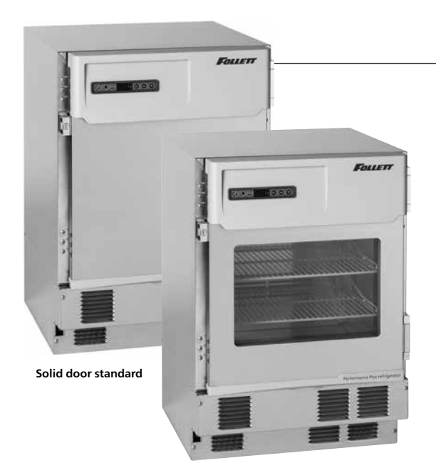
Optional glass door