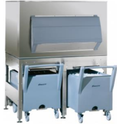
ITS ice storage and transport