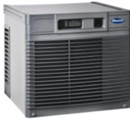
Horizon Elite 710 series ice machine