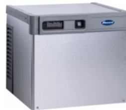
Horizon Elite 2110 series ice machine