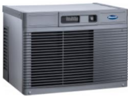
Horizon Elite 1410 series ice machine