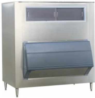
Upright ice storage bins