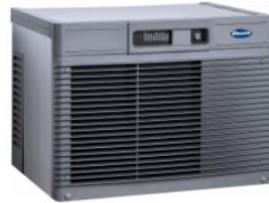
Horizon Elite 1010 series ice machine