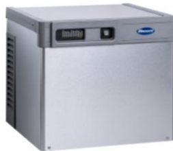
Horizon Elite 1810 series ice machine