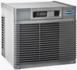
Maestro Plus 425 series ice machine