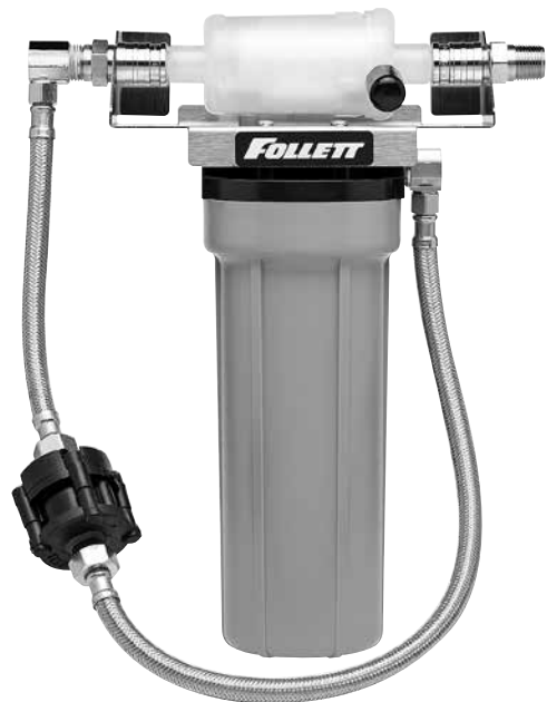
Bacterial-retentive filter system

FOLLETT HEALTHCARE, SAFECLEAN PLUS, SENSORSAFE, SYMPHONY and SYMPHONY PLUS are trademarks of Follett LLC. FOLLETT is a registered trademark of Follett LLC, registered in the US.