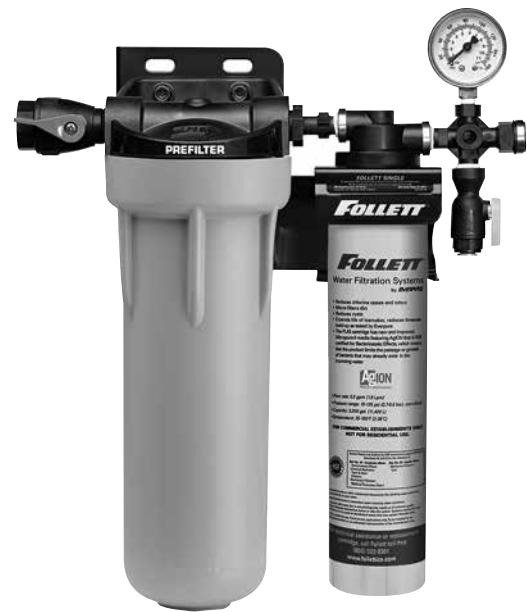
Carbon and carbonless filter