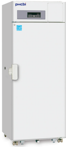
MDF-U731M-PA | FZRMD24