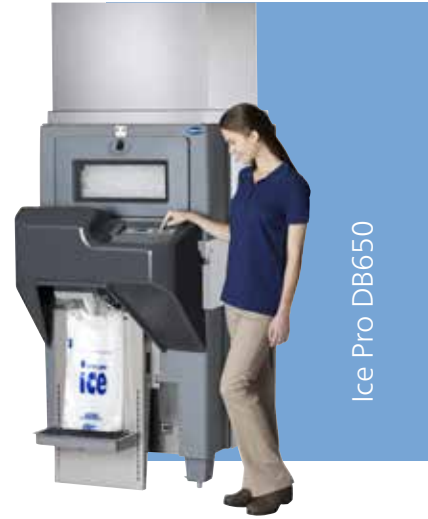
Ice Pro DB650