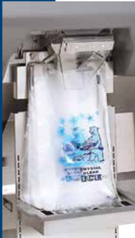
Bags are blown open

Fill 6 to 8 bags per minute. That's 85% faster than manually bagging.