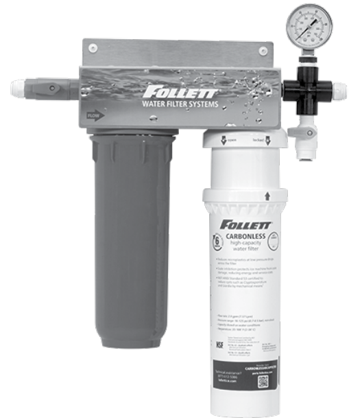
Carbon and carbonless filter