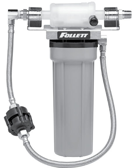
Bacterial-retentive filter system

SAFECLEAN PLUS, SENSORSAFE, SYMPHONY and SYMPHONY PLUS are trademarks of Follett Products, LLC. FOLLETT and FOLLETT HEALTHCARE are registered trademarks of Follett Products, LLC, registered in the US.