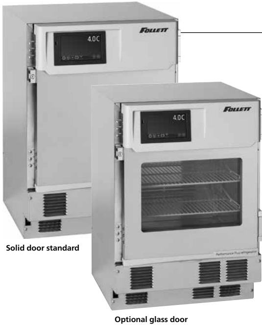
Solid door standard