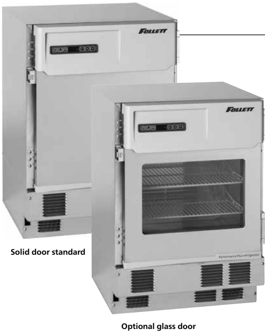
Solid door standard