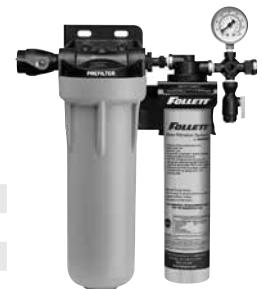
pre-filter primary filter