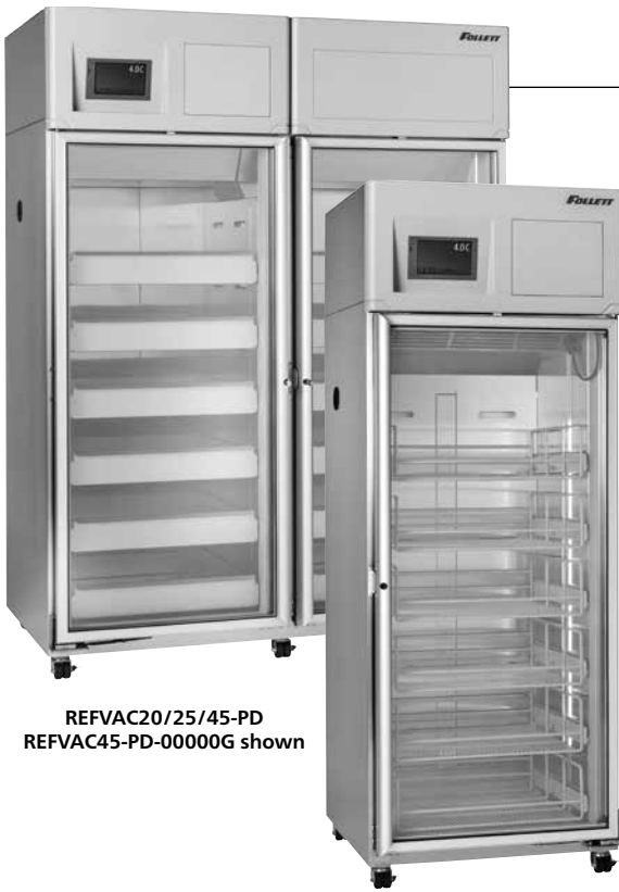
REFVAC20/25/45-PD REFVAC45-PD-00000G shown