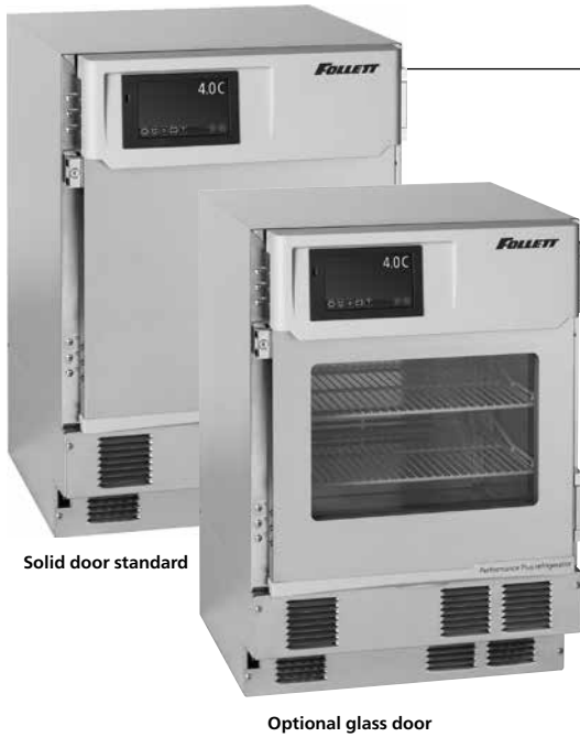
Solid door standard