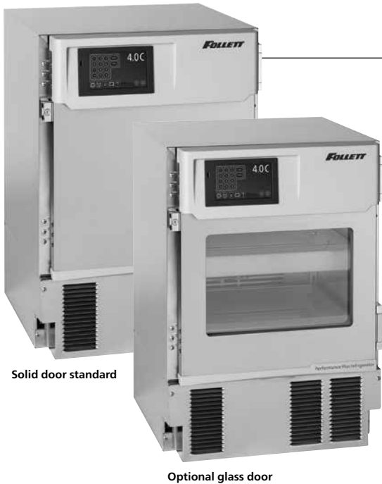
Solid door standard