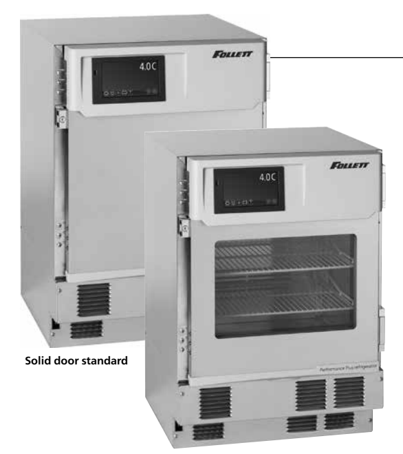
Optional glass door