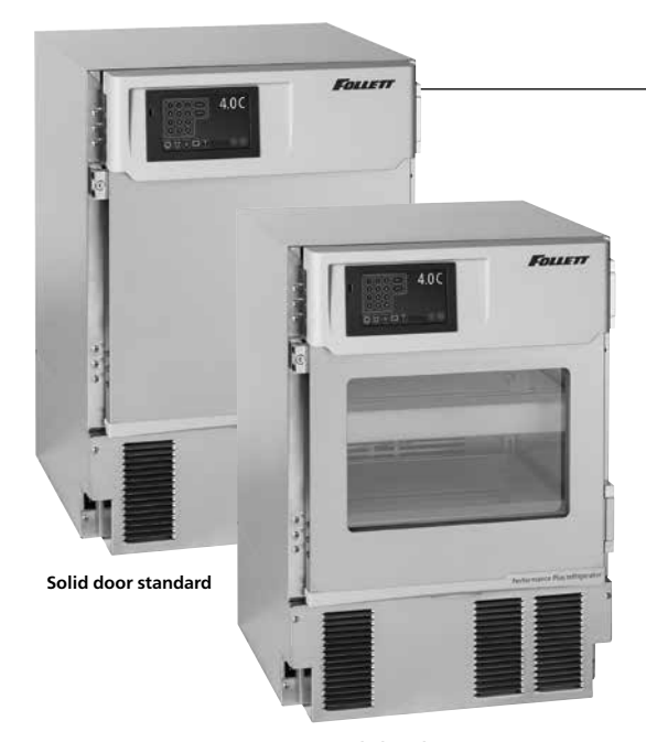
Optional glass door