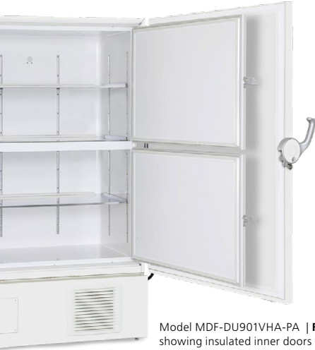
Model MDF-DU901VHA-PA | FZR29-ULT-115 showing insulated inner doors and EZlatch access.