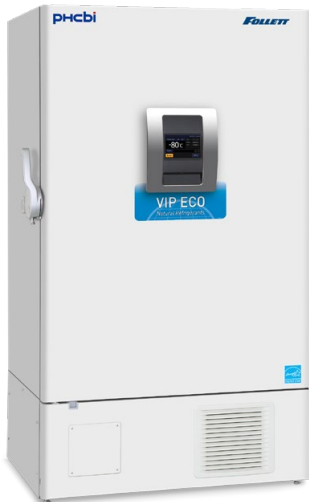
MDF-DU901VHA-PA | FZR29-ULT-115

Large Volume -86°C Ultra-Low Temperature Freezer with Natural Refrigerants